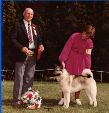
CH Rikkana's True Love 1984 National Anaheim, CA