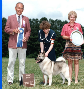
Ch Alcazam's True Colors 1993