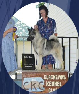
Talon Ch Syringa's Moonlite Hunter

BIS,BISS,SGCH Vin/Melca's Vanguard x Ch Syringa's Janor Ice Crystals