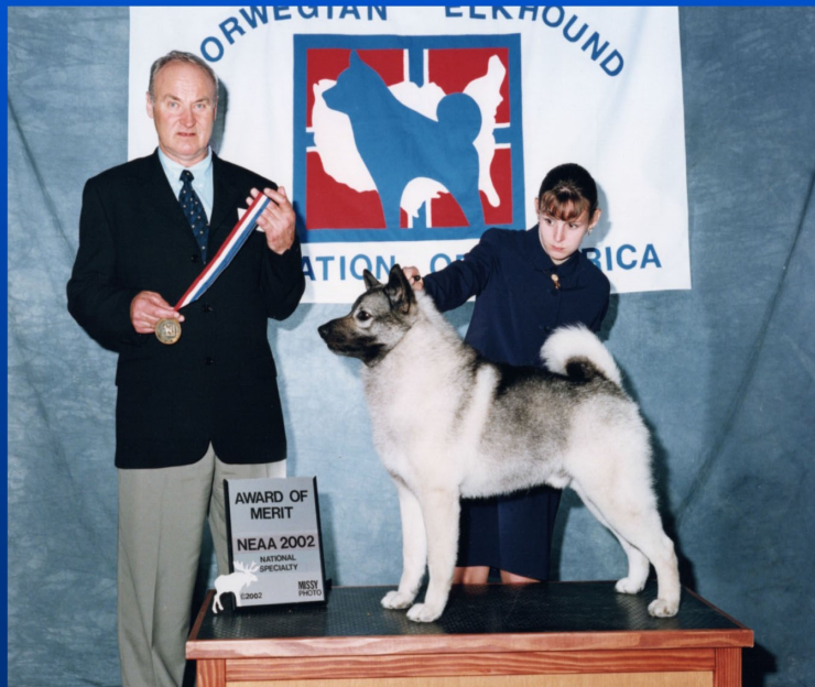
SBIS Ch Alcazam's Back to the Future 2002 National Hutto, TX