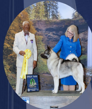
Wilson GCH Syringa's DangerRuss